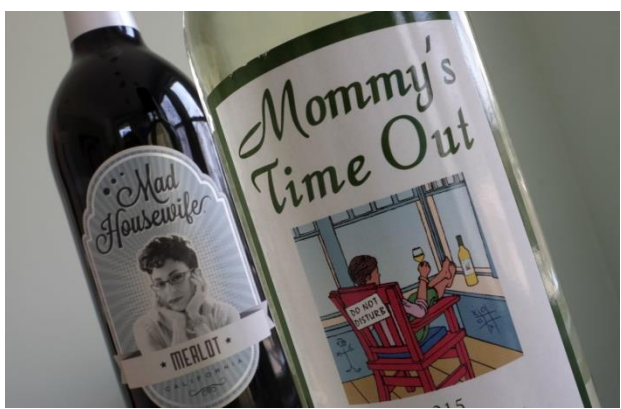
Mommy's Time Out and Mad Housewife are two wines that are marketed toward women.

The trend extends to wine-related housewares. A flask promoted on the Mad Housewife site features two women from the "Mad Men" era asking, "Who is this 'Moderation' we're supposed to be drinking with?"