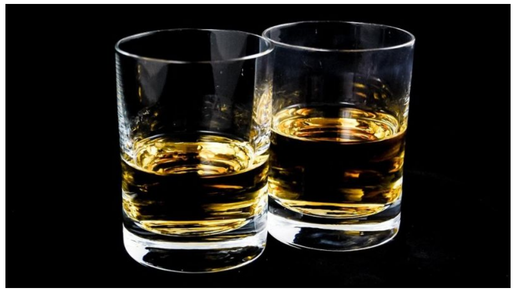
The NIH's alcohol research arm is being accused of serious ethical lapses in its relationship with the industry.

The National Institutes of Health is facing more allegations that it's in Big Alcohol's corner. Not only has the agency been accused of begging the alcohol industry for money—using a sales pitch that implied their results would likely be favorable to the industry, according to a March report from the New York