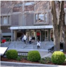
Doctor, Parental Assumptions Can Delay Delivery of HPV Vaccine, Study Says