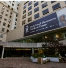
CAO Pilot Grants Awards More Than $1 Million to Boston Researchers

And until then? Maybe fast-forwarding through commercials is the way to go.