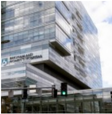
Researchers Develop New Way to Administer Drugs to Transplant Patients

Be respectful of our online community and contribute to an engaging conversation. We reserve the right to remove impersonators or personal attacks, threats, profanity, or flat-out offensive comments. By posting here, you are permitting Boston magazine and Metro Corp. to edit and republish your comment in all media.