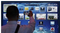
About That Time Warner Cable $5.99 'Modem Lease' Fee