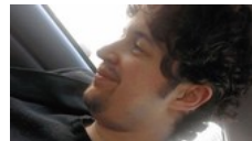
Mom, Stop Calling, I'll Text You All Day