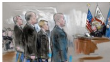
Manning Acquitted of Aiding the Enemy in WikiLeaks Case