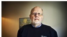
Swedish Serial Killer Saga Unraveled