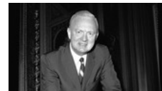
Harry Byrd, Senator From Virginia, Dead At 98