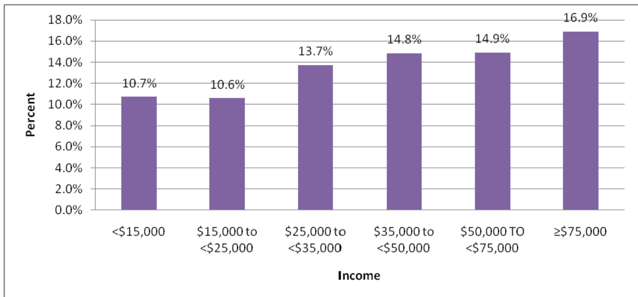
Figure 2. Prevalence in Binge Drinking (Five or More Drinks within Two Hours) in the Past 30 Days among Marylanders Age 18 and Above, 2007-2008 76

The industry also argues that a key economic impact of increased alcohol taxes is a heavier tax burden for lower income households. In fact, alcohol excise tax increases paradoxically both do not fall most heavily on the poorest families, and have the greatest likelihood of improving the lives and health of those families. This is because first, both alcohol consumption and binge drinking are most likely to be found, not among the poorest households, but among the wealthiest, 74 as the data for Maryland in Figure 2 demonstrate. Second, alcohol taxes have their greatest impact on people who drink in an unhealthy way. If poor people drink, they are more likely to binge drink than higher income groups. They are also more likely to suffer from negative health and economic consequences of alcohol use. 75 Thus, for the small minority of lower-income people who drink, the tax increases will depress consumption and decrease the disproportionate burden of consequences from alcohol use born by the lowest income groups. Interestingly, poor people are the most likely to support alcohol excise taxes in national public opinion polling. 64